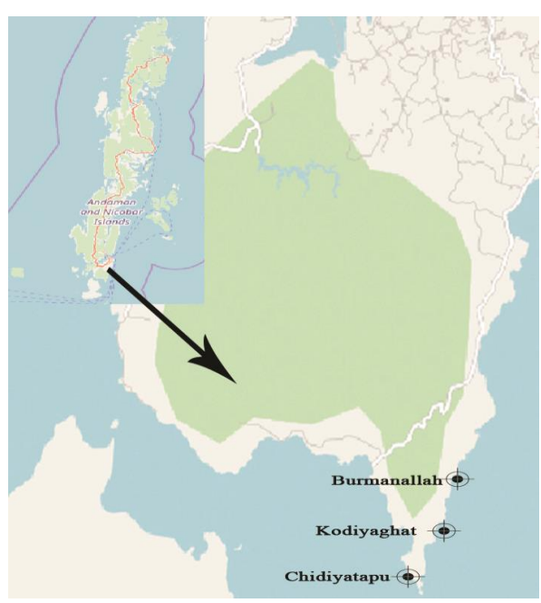
Figure 1. Map showing the three Study sites

ter of Andaman Island, especially from a typical tropical marine habitat of Indian EEZ leads to the present study.